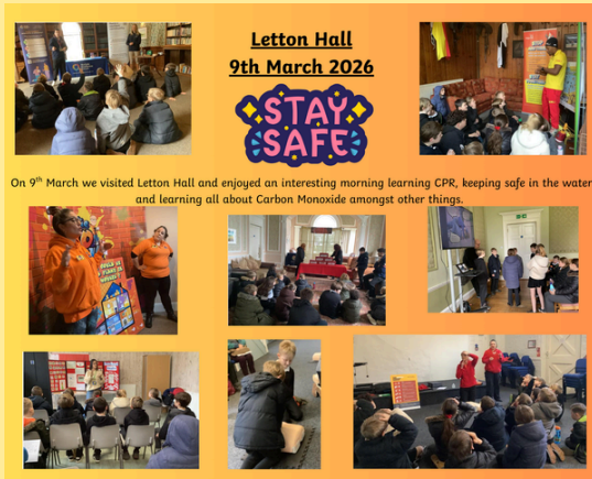
On 9th March we visited Letton Hall and enjoyed an interesting morning learning CPR, keeping safe in the water and learning all about Carbon Monoxide amongst other things.

On Monday 9th March, we visited Letton Hall and enjoyed an engaging morning learning CPR, discovering how to stay safe in the water, and finding out all about Carbon Monoxide, along with several other important safety skills.